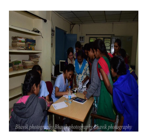
Dental check up